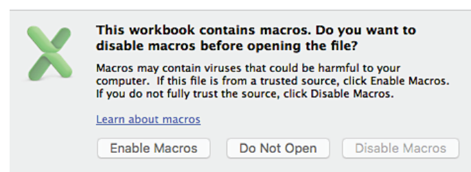
Figure 1 Macro check for Macintosh computers.

Double clicking on the icon will automatically open the spreadsheet, with a warning about macros prior to initialisation (Figure 1). The spreadsheet has been screened and validated as being virus free, so click on the left hand icon, "Enable Macros". The program will then display the opening page, within which are two writable boxes seeking input on either 'Author' or 'Keyword'. In this example, the name "Skues" is entered in the Author box. (Figure 2). Pressing the icon, "Search for Author" will result in a new page being displayed, showing the search results that are filtered to contain the name of the entered author (Figure 3).